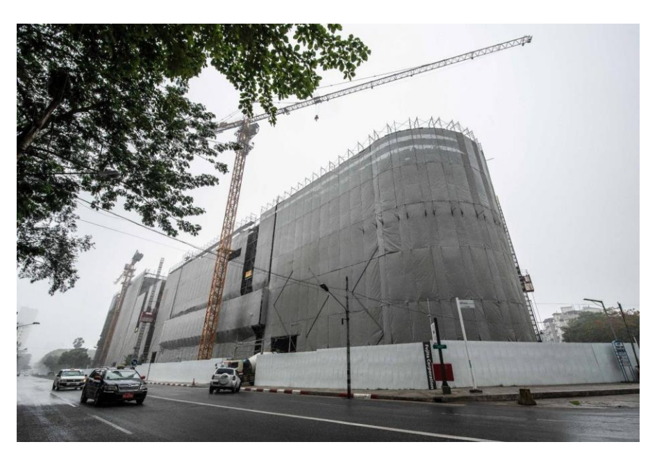
Figure 2: Y Complex under construction (2021. Photo credit: Myanmar Now)

and parking lots on a site area of 16,007.89m<sup>2</sup> and a total floor area of 92,627.91m<sup>2</sup>.<sup>26</sup> The investment permit was acquired in May 2017, and in July 2018, the construction permit was acquired. Construction began in August of the same year. According to the plan, the building was scheduled to open in 2021<sup>27</sup> and Tokyo Tatemono was to operate the offices, Fujita build and construct the building, and Hotel Okura operate the hotel and serviced apartments.