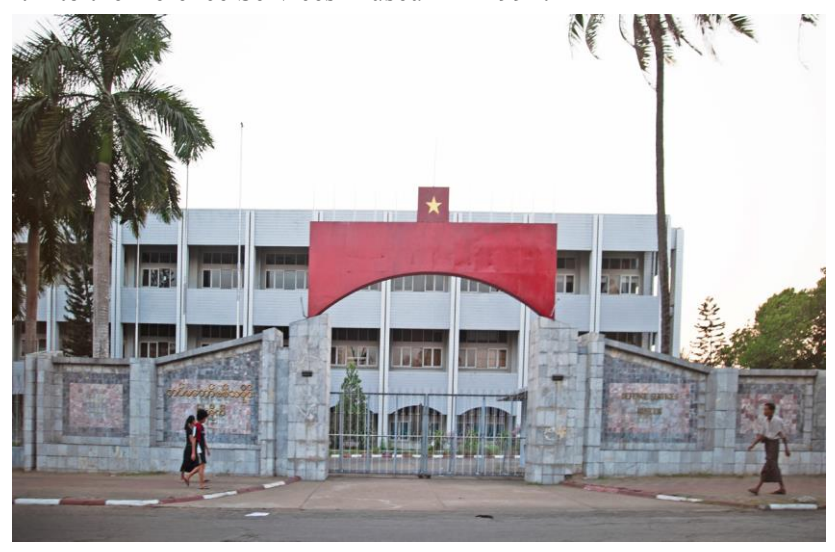
Figure 3: Defence Services Museum (2010. Photo Credit: Yuzo Uda)

revered founding father, drafted the first constitution and where his funeral was held after his assassination. The military regime dismantled Jubilee Hall in 1985, managed the land, and turned it into the Defence Services Museum in 1994.<sup>29</sup>