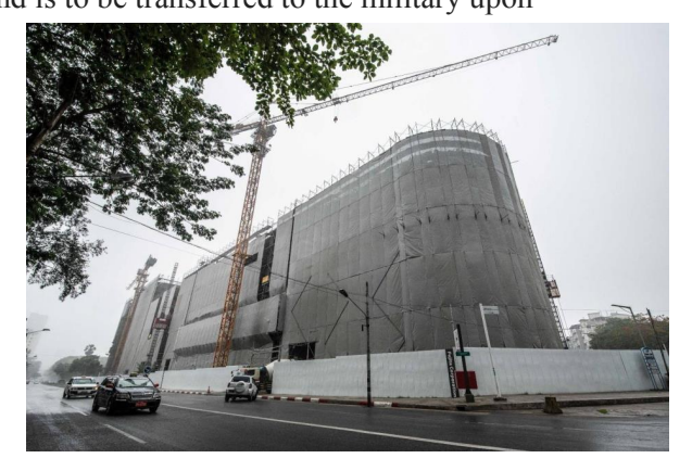
Y Complex Project Construction under way (2021)

termination or expiry of the land lease. This US$144 million project is co-financed by Mizuho Bank, Ltd., Sumitomo Mitsui Banking Corporation and the Japan Bank for International Cooperation (JBIC).