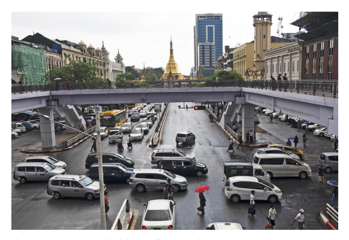
Figure 1: Near the project site

While not included in the IIFFMM report, "Economic Interests of the Myanmar Military," there is concern that the Redevelopment of the Defence Services Museum Project (known as Y Complex) will bring significant economic benefits to the Tatmadaw. The project is operated by Japanese companies and involves the construction of a large-scale real estate complex on the site of the former Defence Services Museum in a prime location near the Shwedagon Pagoda, a place of great cultural and historical significance in Yangon.